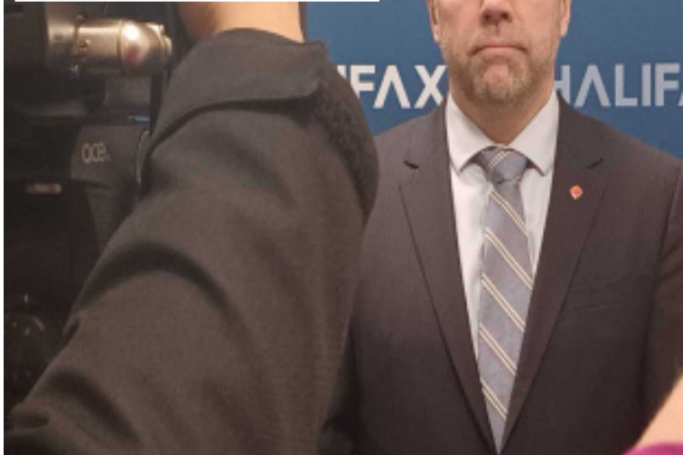
caption Mayor Andy Fillmore in a scrum with media in 2025.