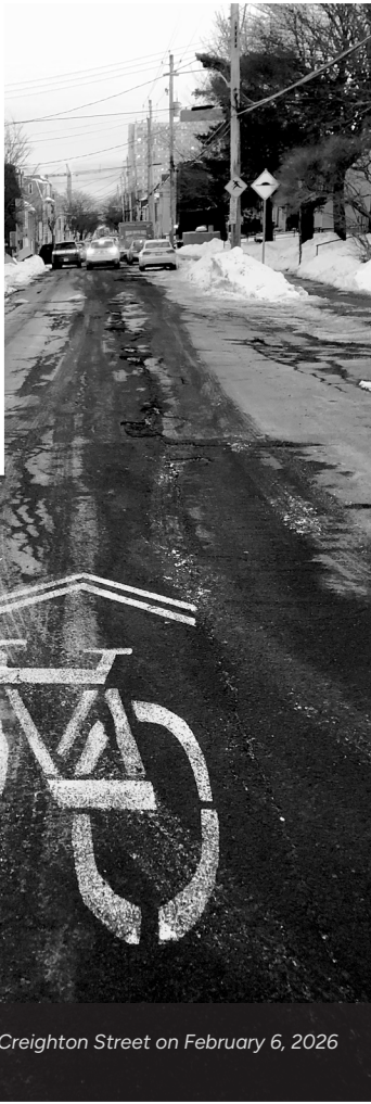
caption Bike "infrastructure" and potholes on Creighton Street on February 6, 2026