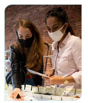
Shopping at Drala Books & Gifts.