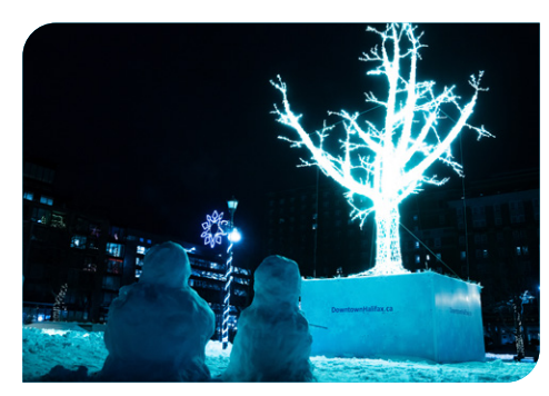
Enjoying the Holiday light display at Peace and Friendship Park.

Every spring, DHBC fills Downtown Halifax with over 170 volunteers from over 20 corporate offices to sweep the streets for the Annual Clean Sweep. The event also serves as an official kick-off for DHBC's Downtown Halifax Crew, a team of students that provide tourist information and keep Downtown Halifax clean throughout the spring and summer. It is a great opportunity for our members to get outside and engage with one another while working towards a