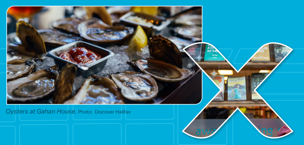
Books on display at Venus Envy.

All photos in this document were taken while following the directives of the Nova Scotia Health Authority and adhering to provincial COVID-19 restrictions.