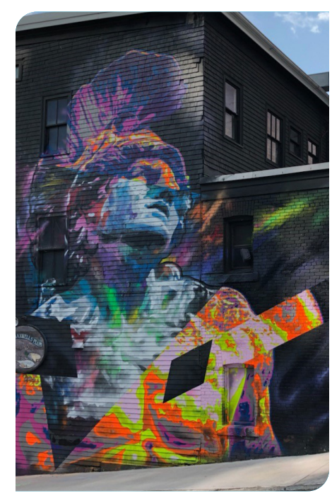
"Defeat" mural by Mike Burt, located at 1580 Grafton Street.