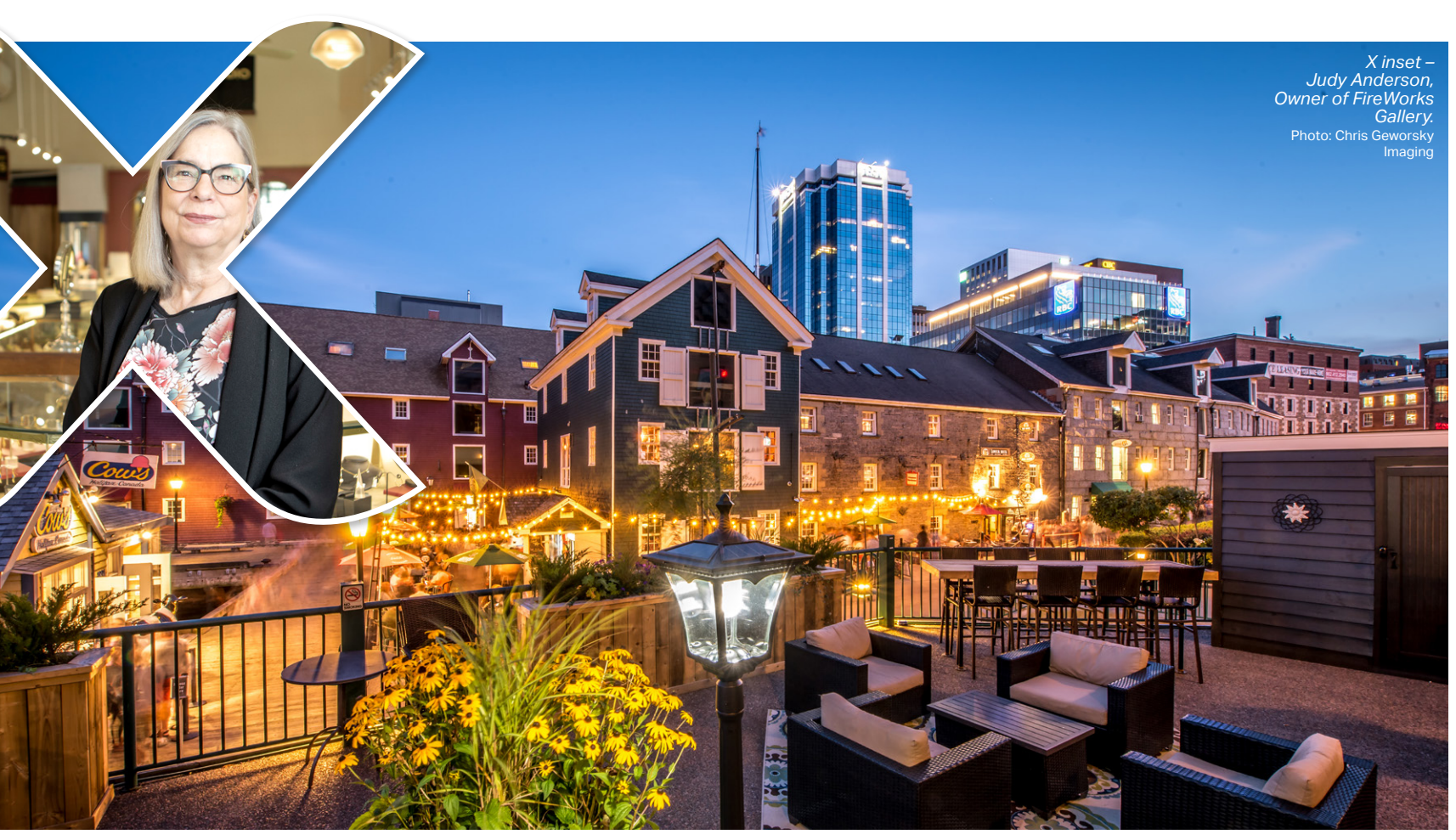
The view from the Stone's Throw Patio, Halifax Marriott Harbourfront Hotel.