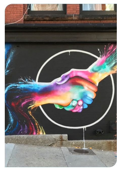
"Connection" mural by Daniel Burt, located on the Blowers side of 1558 Barrington Street.