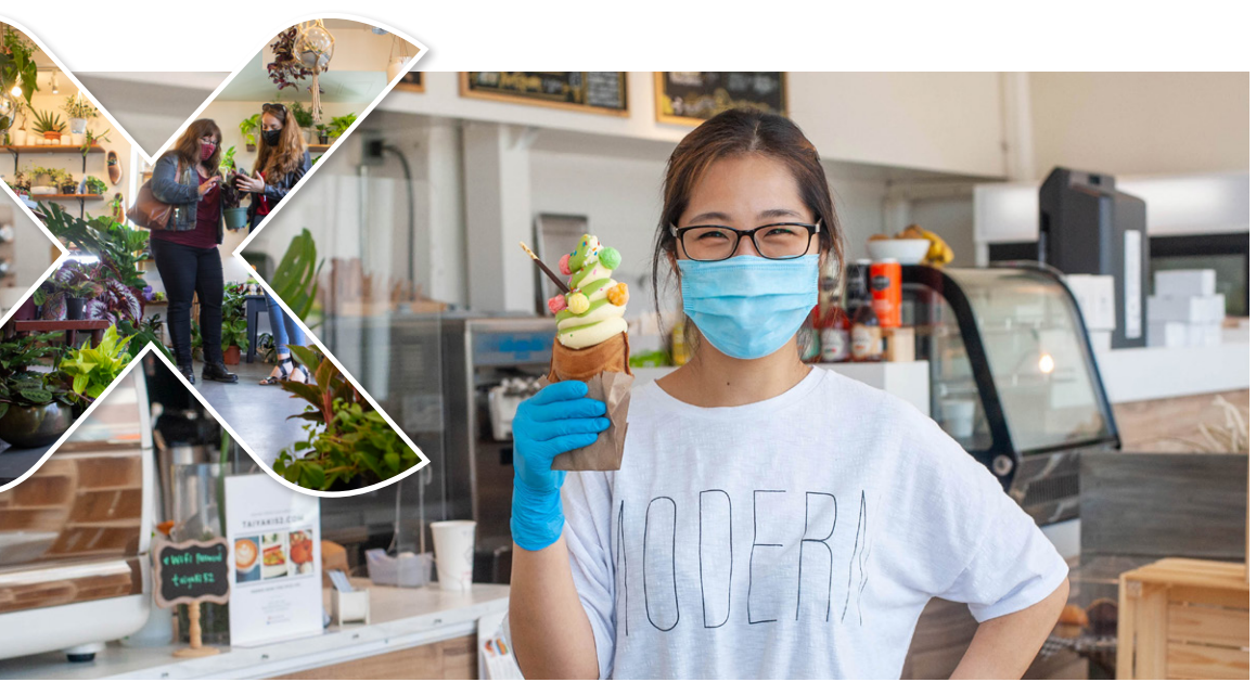
X inset – Picking out plants at Audrey Too.

and posters and painting public items such as garbage cans and lamp posts. The Downtown Halifax Crew also serves as a valuable resource for tourists and visitors looking for directions or recommendations.