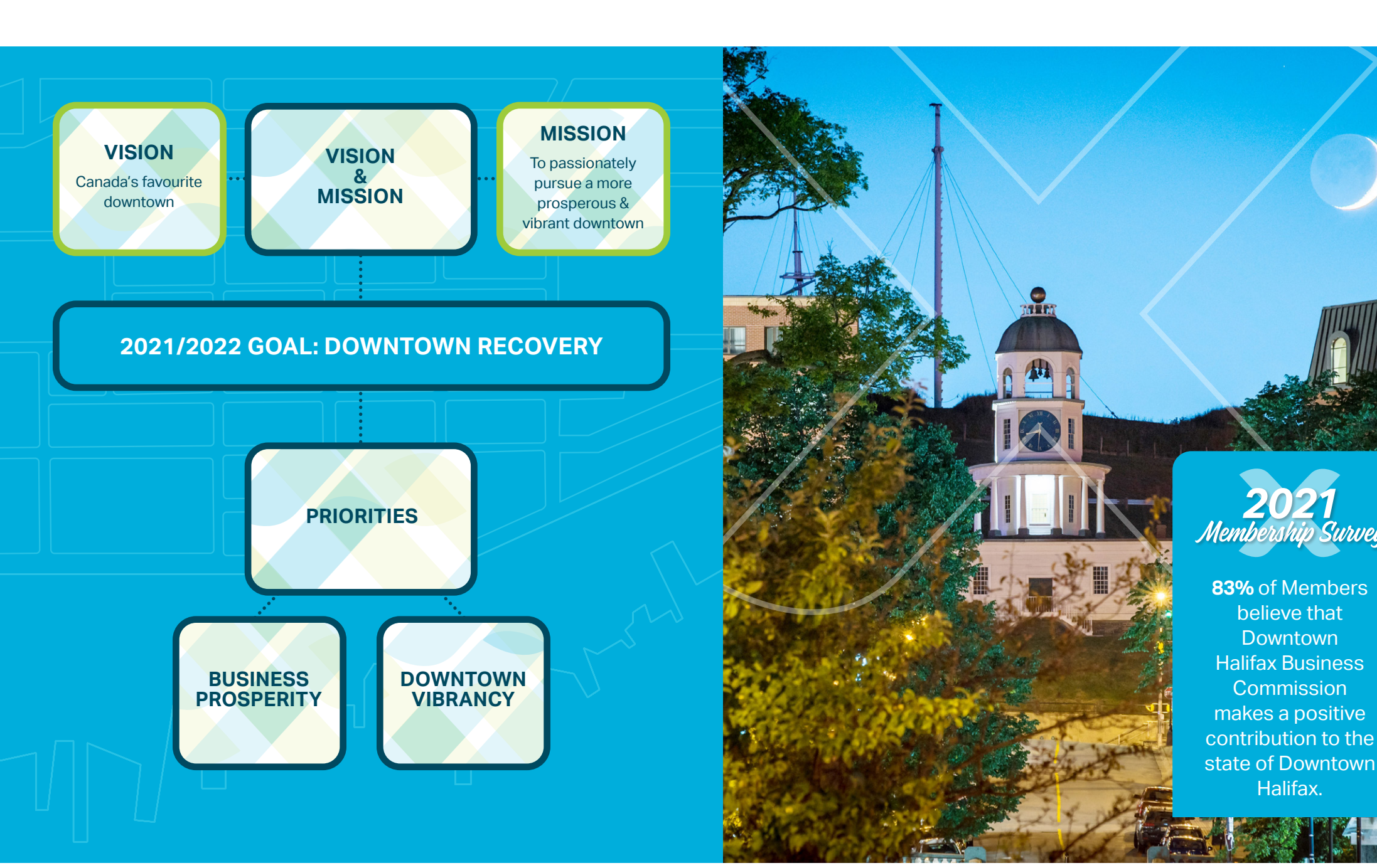
The Old Town Clock at night.