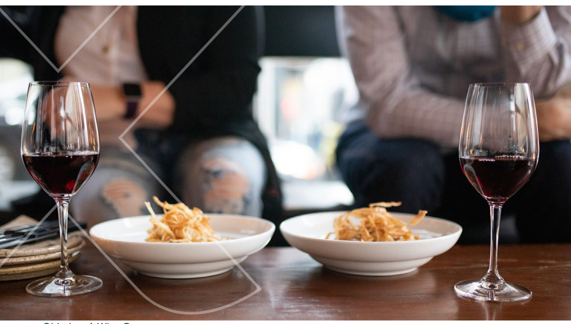
Obladee, A Wine Bar.